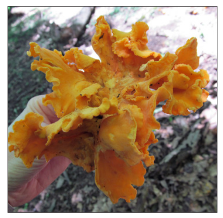
ABOVE & RIGHT: Cecily's super chanterelle and bounty!